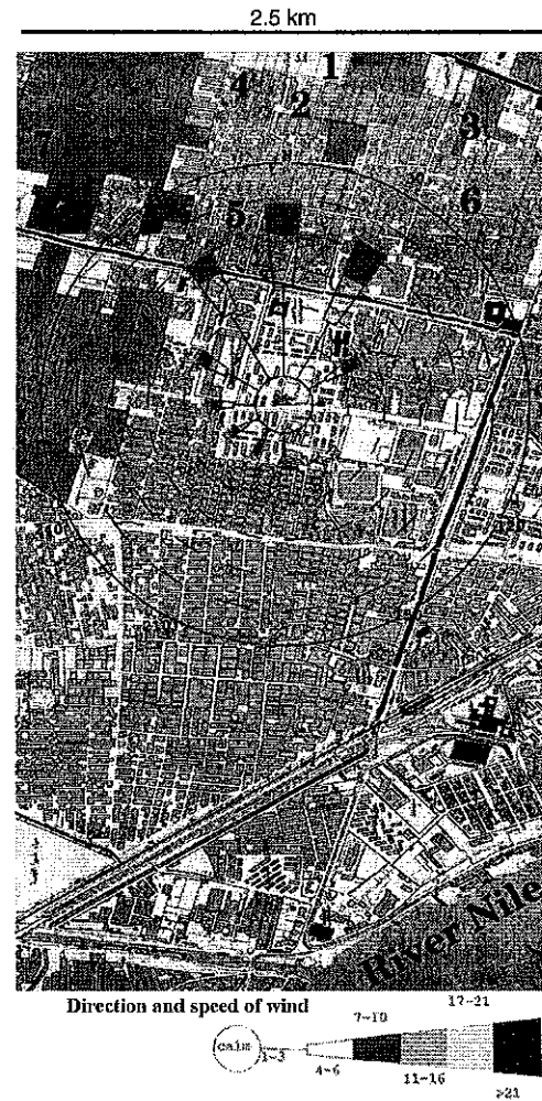
Figure 1 Map of Shubra El-Kheima city with superimposed direction and speed of wind. Sampling areas: (1) Asbestos plant (Sigwart store); (2) El-Wehda El-Arabia; (3) Manshiyat El-Horriya; (4) Ezbet Rostom; (5) Ezbet Osman; (6) Manshiyat El-Gadida; (7) Manshiyat Abdel Moneim Riad

the 2000 census population data were obtained from the Egyptian Central Agency for Public Mobilization and Statistics. All sampling sites were located within 2 km of the asbestos plant. El-Wehda El-Arabia area